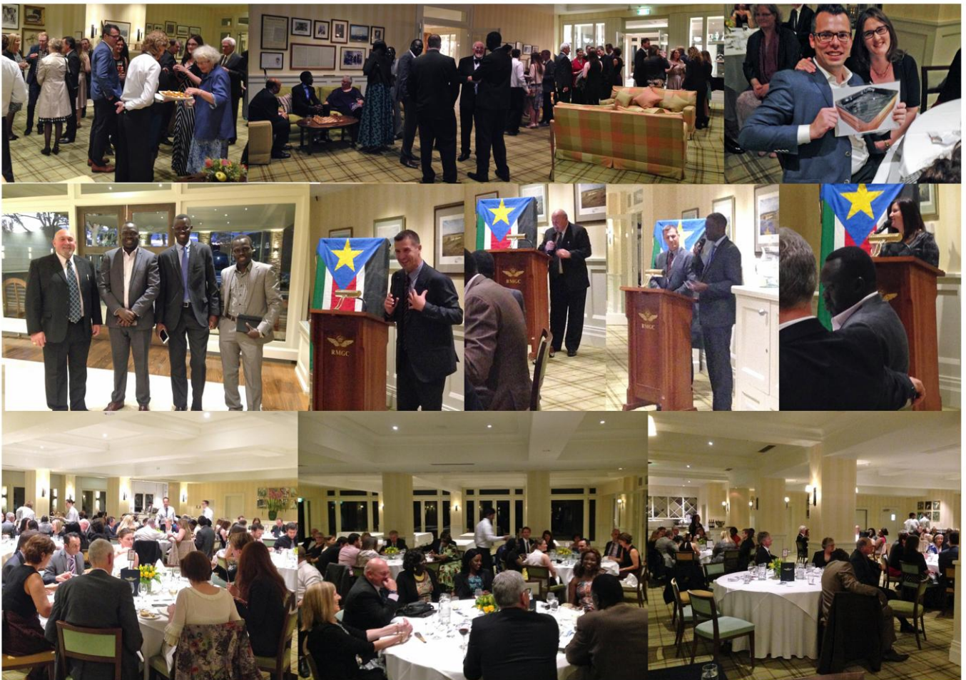
South Sudanese Information Night - Royal Melbourne Golf Club - 12th September 2015